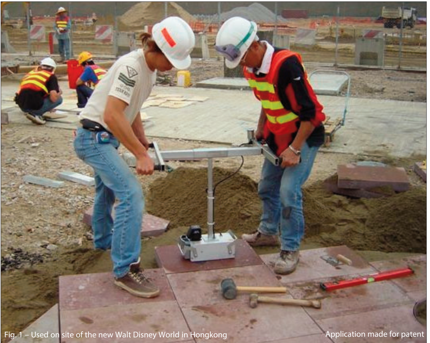
Fig. 1 – Used on site of the new Walt Disney World in Hongkong