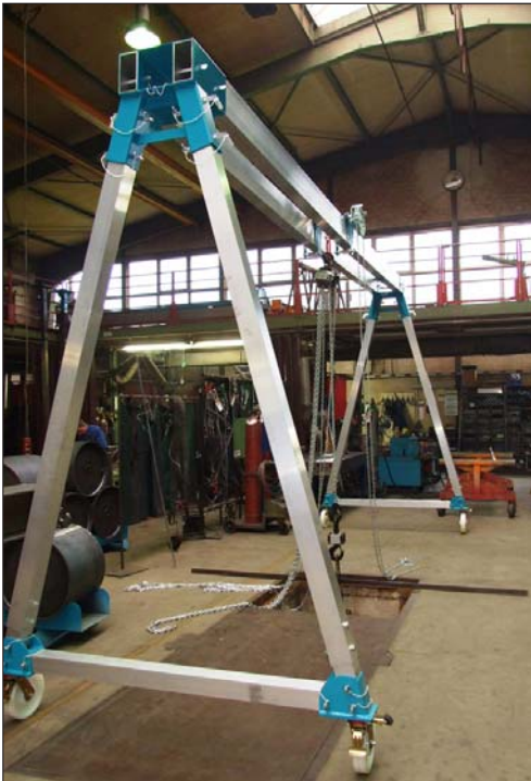
535 505: 1.5 t beam length 6 m Double girder design Rigid height 3.5 m Hand-gear trolley