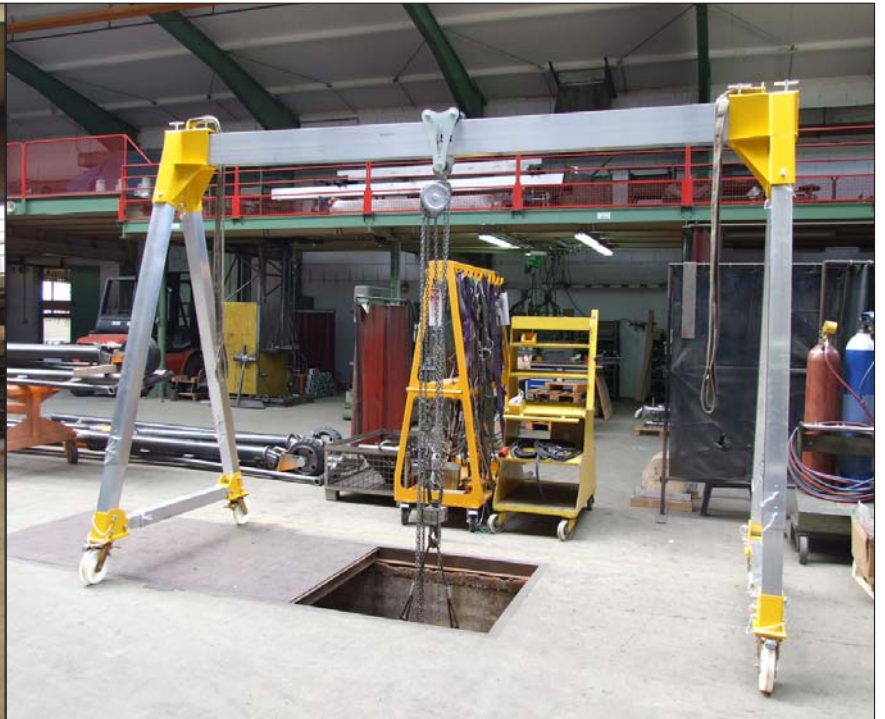
535 510: 1.5 t beam length 4 m Adjustable height 2.9 / 4.0 m