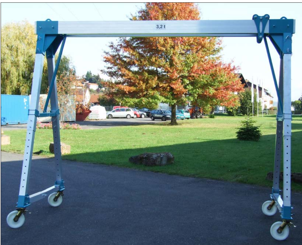
535 200: 3.2 t Double girder design Beam length 4 m Adjustable height 2.4 / 3.2 m