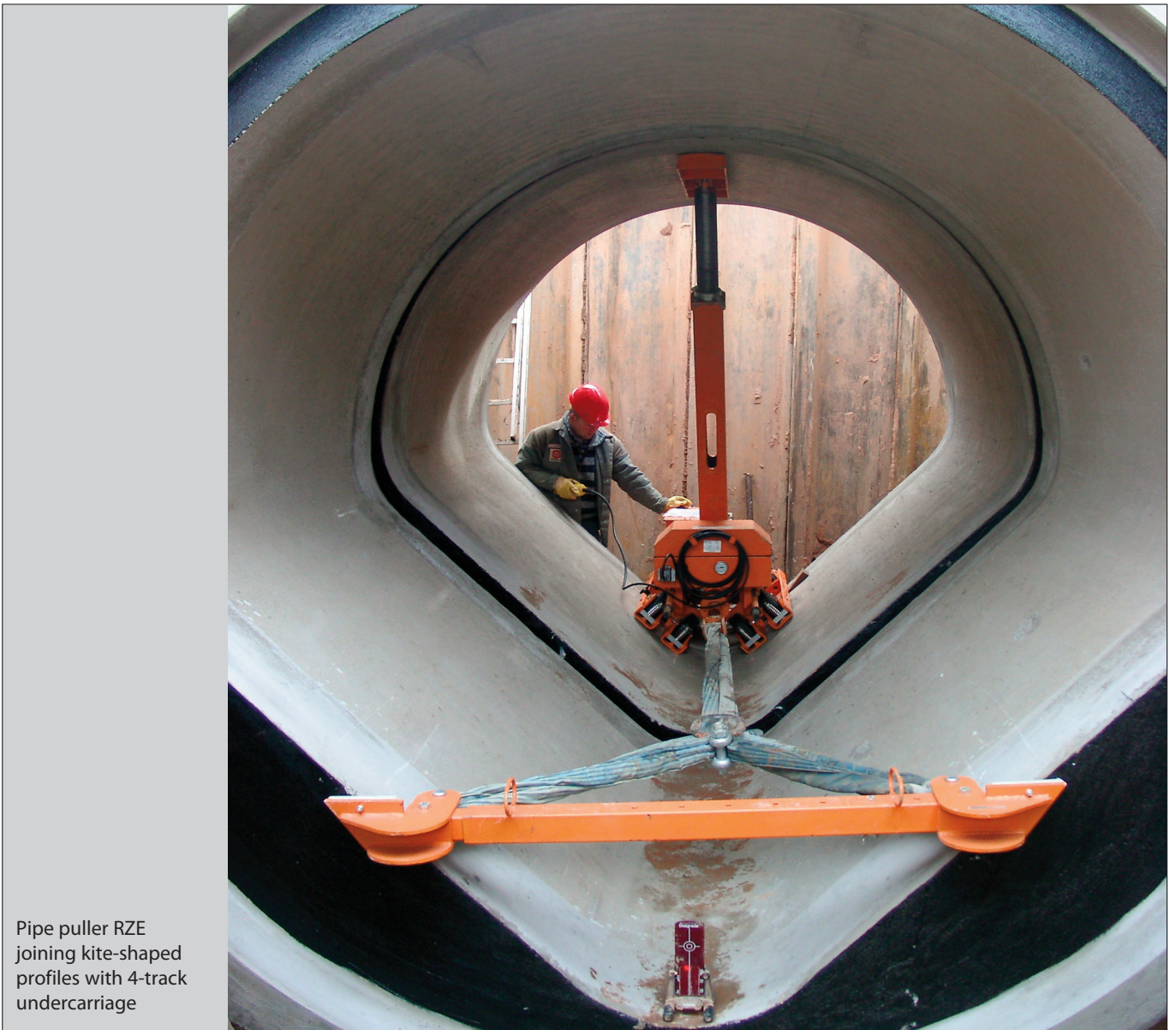
Pipe puller RZE joining kite-shaped profiles with 4-track undercarriage